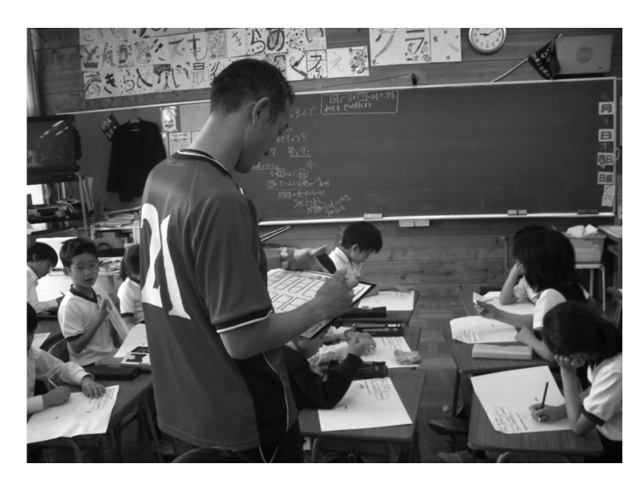
Figure 2. A teacher using a seating plan to record his Year 3 students' solutions

Because of the extensive koyzaikenkyu , the teacher has an understanding of likely student responses and strategies to the lesson task, including more efficient strategies, as well as common student misunderstandings. Detailed observation of actual student responses while students work allows the teacher to carefully orchestrate the order of solutions to be shared.