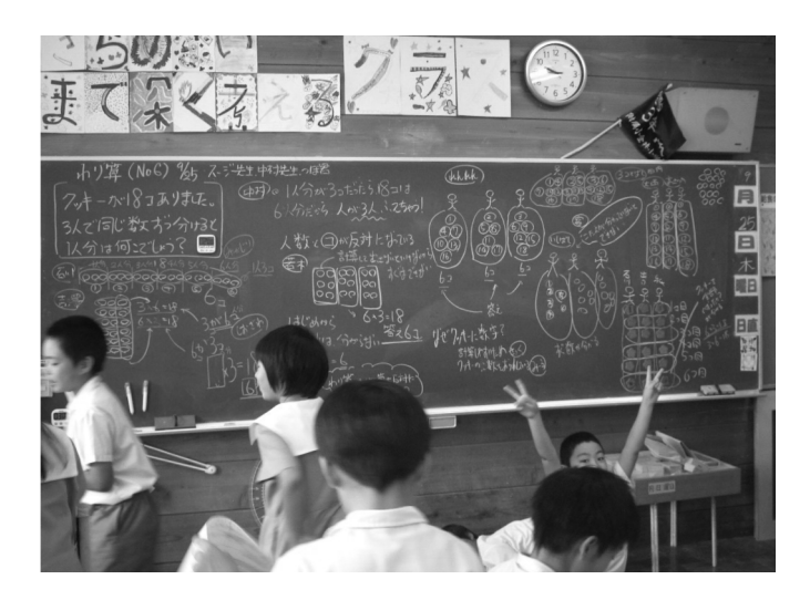
Figure 3. Photograph of the blackboard at the end of a Year 3 lesson on division

thinking and model good organisation of notes. Figure 3 shows one of the author's photographs of a blackboard at the end of a Grade 3 lesson on division.