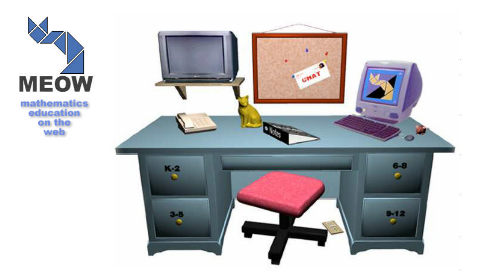
Figure 1. The main MEOW interface.

The design of the MEOW website utilises databases to simplify management and provide a flexible, yet efficient means of displaying and representing the content. The database driven approach has been used for a range of reasons: