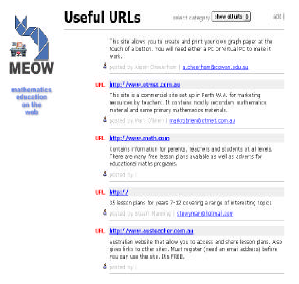
Figure 3. The useful websites.

themselves, together with a short annotation describing its value to other preservice teachers.